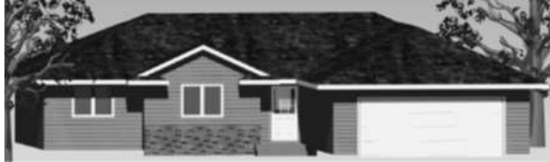
This design is a combination of the following: PlanCollection #109-1098, 131-1162; Houseplans #124-141; Homeplans #homepw00783