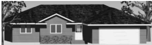
This design is a combination of the following: Plan Collection #109-1098, 131-1162; Houseplans #124-141; Homeplans #homepw00783

1,452 sq. ft. three bedroom, two-bath ranch w/attached 2-car garage